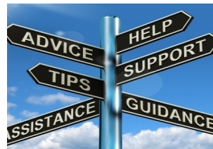
Helpful Tips for using the Portal - 2007s, 2008s & More