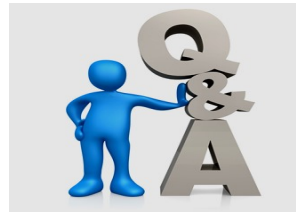
You Asked, We Answered

We need questions for our "You Asked, We Answered" section! What do you want or need to know about the NCAH Portal?